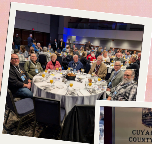
CCF Fairboard Directors enjoying the Convention together.