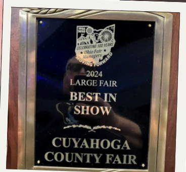
Best In Show Award Plaque