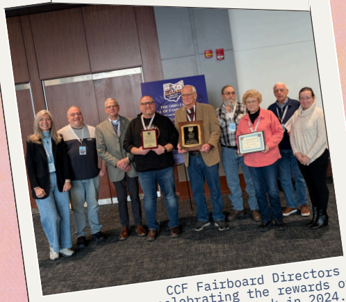
CCF Fairboard Directors celebrating the rewards of their hard work in 2024.