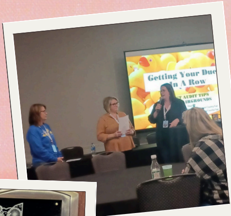
"Ducks In A Row" Audit Presentation