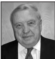
Robert Haas Fire & Safety Trailer Park