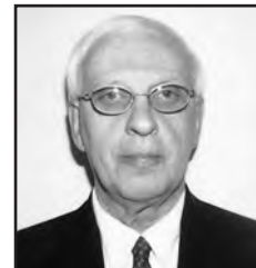
Charles Sculac Entertainment Grandstand, Grants